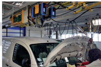
Quality control point